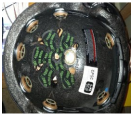
Figure 1: Tactile Headset

The head-mounted tactile interface prototype is similar in design to the system developed by Kalb et al. [6]. The interface consists of a set of tactile actuators, controlled by an audio adaptor (Vantec USB External 7.1 Channel Adaptor) and a laptop. In the current version of the prototype, up to eight actuators are affixed to a helmet (Figure 1).